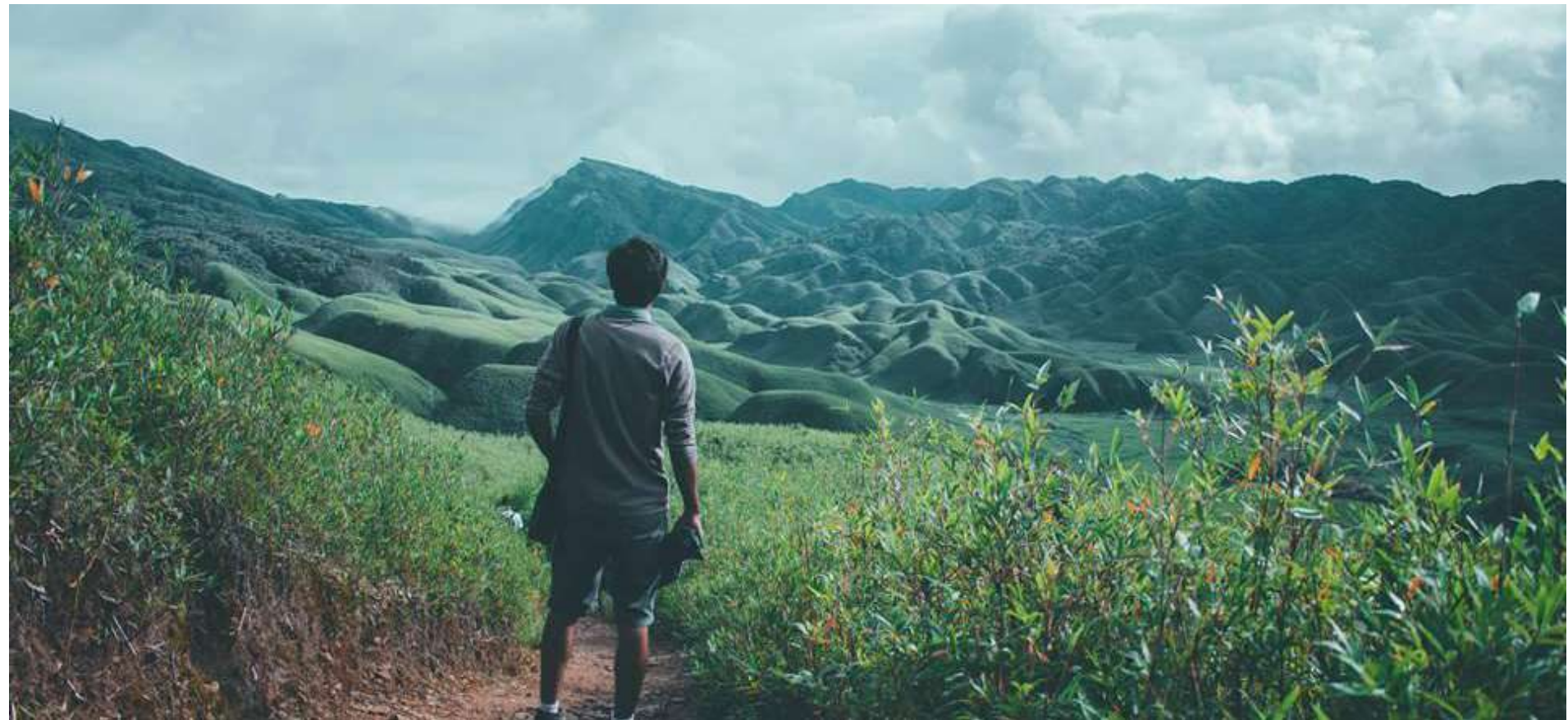
The majestic Dzukou Valley